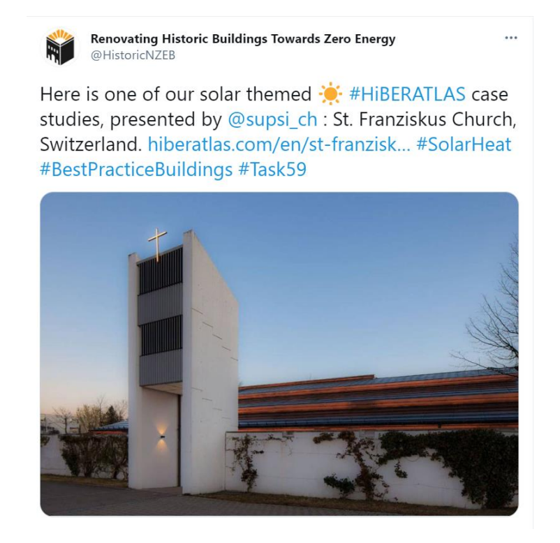
Figure 12. A social media post highlighting one of the HiBERatlas case studies, linking to the partners responsible as well as the #SolarHeat hashtag.

Another important part for the dissemination was the social media posts, an example of which is shown in Figure 12. Many of the posts in 2020 linked back to the case studies. As the case studies were finalised and available online, they were publicised via a social media post. Features, such as the geographic search, were also mentioned via social media, to show the full range of functionality of the database. The posts served as a hook to invite followers to find out more about the case studies as well as the database as a whole.