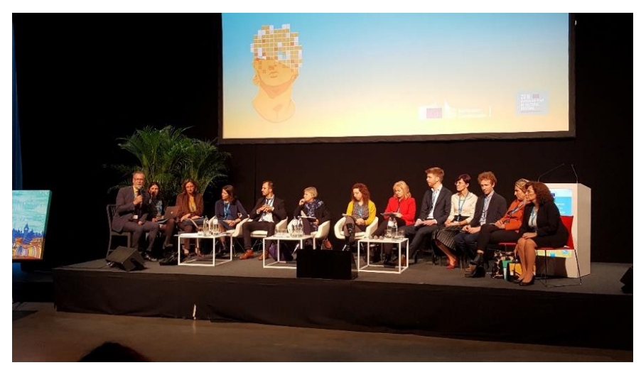
Figure 6. Fair of Cultural Heritage discussion panel.

Some events favoured a speakers' panel at the end of each session, where there could be a discussion of specific points, as at Figure 6. A list of these events is presented in Table 3.