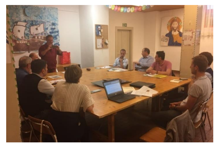
Figure 5. Image from the meeting and worktable for construction of a solar plant in a historic church in Lugano, organised by SUPSI.

Some events favoured a speakers' panel at the end of each session, where there could be a discussion of specific points, as at Figure 6. A list of these events is presented in Table 3.