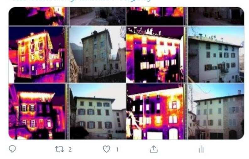
Figure 10. A typical tweet post, promoting one of our blog posts, and linking to the SHC Task 59 website.

Take a look at our new blog post: a spatial-based approach for enhancing energy renovation of historic settlements @ @EURAC #Task59 #BestPracticeBuildings task59.iea-shc.org/blog