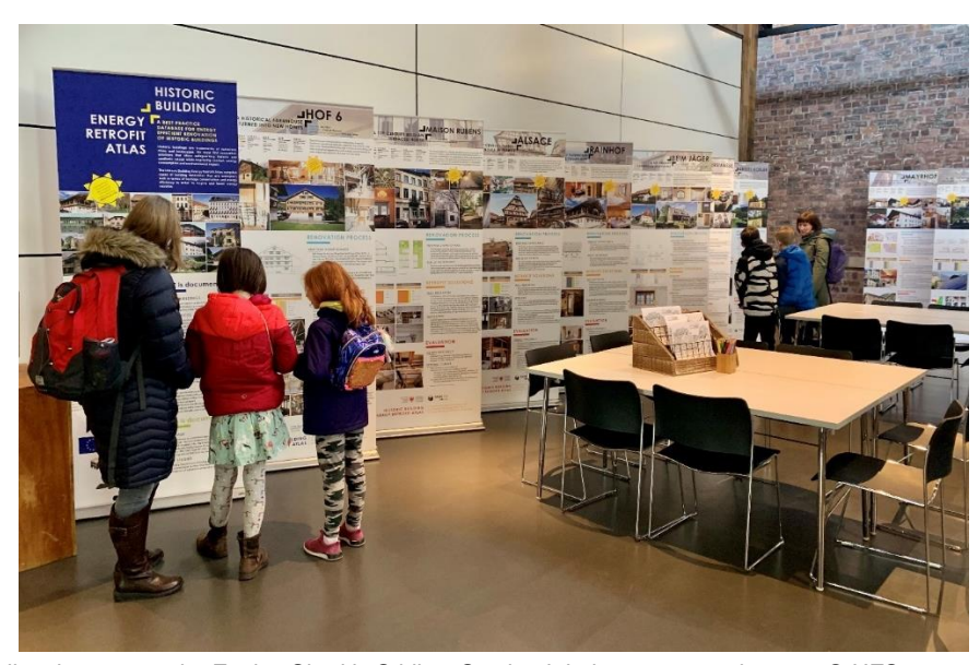
Figure 9. The pull up banners at the Engine Shed in Stirling, Scotland during an outreach event.

A touring exhibition was one of the Subtask D deliverables. One of the project partners, EURAC, led on the design and print of 12 pull up banners to showcase the work of partners across the project area. This was completed in Year 2 of the project, and a schedule of locations was agreed with EURAC and partners at the expert meeting in Munich. They were used to support other outreach activity organised by partners and associated organisations. Their positioning was generally in the hall or foyer space of a venue, where attendees could circulate among the banners; an example of such a placing is at Figure 9, where the banners were used to support the HES event at the Engine Shed in Stirling, Scotland. By late 2019 the exhibition had been moved to five locations (see table 6 for the schedule) but the onset of restrictions in Spring 2020 obliged it to be returned to EURAC. In addition to the events where the banners were used, the list below shows the potential events where banners were planned to be present, which had to either be cancelled or held online due to the restrictions.