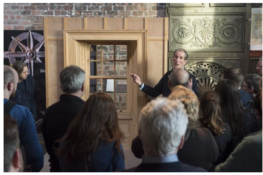
Figure 8. A model of a historic timber window made by HES at the Engine Shed being used in trade outreach © HES.