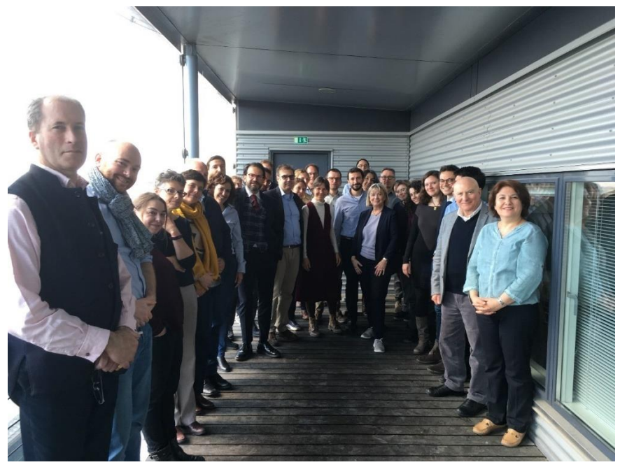
Figure 1. Meeting and networking in Copenhagen.