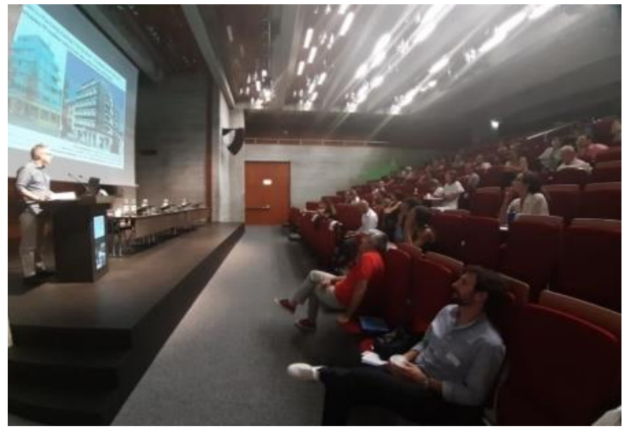
Figure 3. Image of the 'Solar architecture: energy in Dialogue' event in Canobbio, organised by SUPSI.

and plan, with related organisations such as the Energy Savings Trust speaking on how it would be implemented. The second day was focused on technical level matters. Table 2 shows the list of these events.